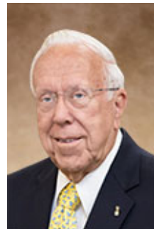
George T. Elmore Hardrives, Inc.