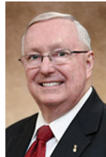
Stormet C. Norem Boynton Memorial Chapel